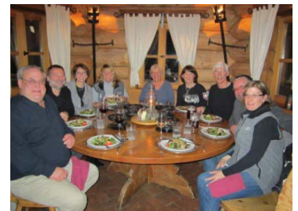
Enjoying Fondue night at the Bavarian Lodge